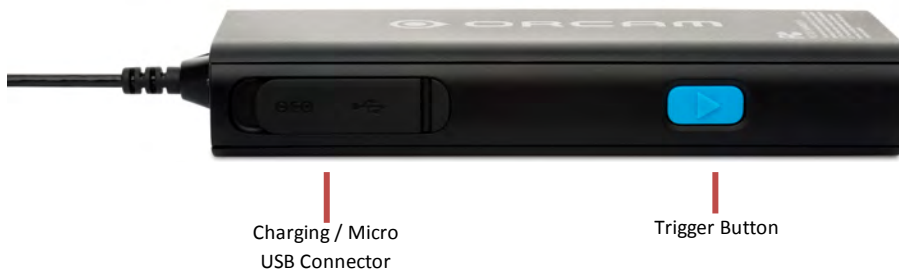
Charging and Micro USB Connectors and Trigger button