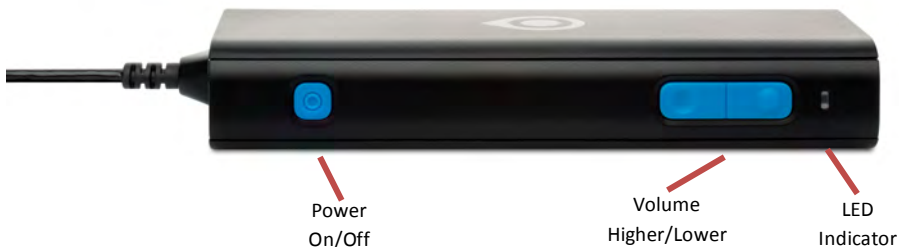
Location of Power and Volume Buttons and LED Indicator

Trigger Button is the blue button on the opposite side of the Volume button, on the same side as the rubber flap. It has three functions. It is used to activate the camera, activate the product learning mode, and change the read-back speed.