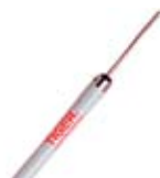
PANA-PACIFIC 48" Top-Loaded Tunable-Tip CB Antenna Part Number: STT4

Product Features: Stainless Steel • 4 Sections • 84" Mast • 96" Cable