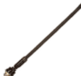
PANA-PACIFIC Adjustable FM Antenna Part Number: PPC00358

Product Features: Allows the user to tune into more AM and FM stations.