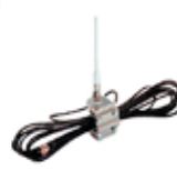
PANA-PACIFIC 48" "No Ground" CB Antenna Kit Part Number: NGP1

Product Features: Stainless Steel Whip • 45" High • 18' Cable with PL-259 Connector • 8 oz. Magnet • Generic packaging