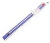
PANA-PACIFIC 42" Full Spectrum Multi-Band Replacement Antenna White w/Black Cap Part Number: FSMS3

Product Features: Kit includes two FSMS1 multi-band replacement antennas, EVCBFM1 multi-band Splitter Box, two aluminum mounting brackets and coax cable.