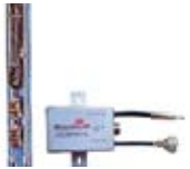
PANA-PACIFIC Full-Spectrum Multi-Band Antenna System Part Number: FSMS2

Product Features: This Multi-Band Replacement Antenna combines AM/FM, Weatherband (WX) citizens band (CB) and cellular phone (CP) frequencies on one single antenna. This antenna's unique multiple "TRAPS" are integrated onto the fiberglass rod allowing "MAXIMUM GAIN" for full signal strength on all frequencies. Works on ALL TRUCKS with multi-band antenna systems installed at the factory or at the dealer.