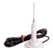
PANA-PACIFIC 45" Magnetic Mount CB Antenna Part Number: MM1012

Product Features: This Multi-Band Replacement Antenna combines AM/FM, Weatherband (WX) citizens band (CB) and cellular phone (CP) frequencies on one single antenna. This antenna's unique multiple "TRAPS" are integrated onto the fiberglass rod allowing "MAXIMUM GAIN" for full signal strength on all frequencies. Works on ALL TRUCKS with multi-band antenna systems installed at the factory or at the dealer.