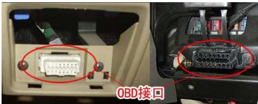
OBD 接口 OBD interface