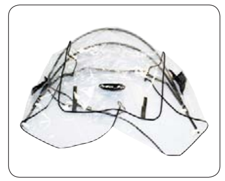
1 x Assembled Rain Canopy (c/w fixings)