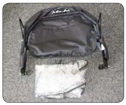
1 x Assembled Sunshade (c/w fixings) 1 x Rain Canopy