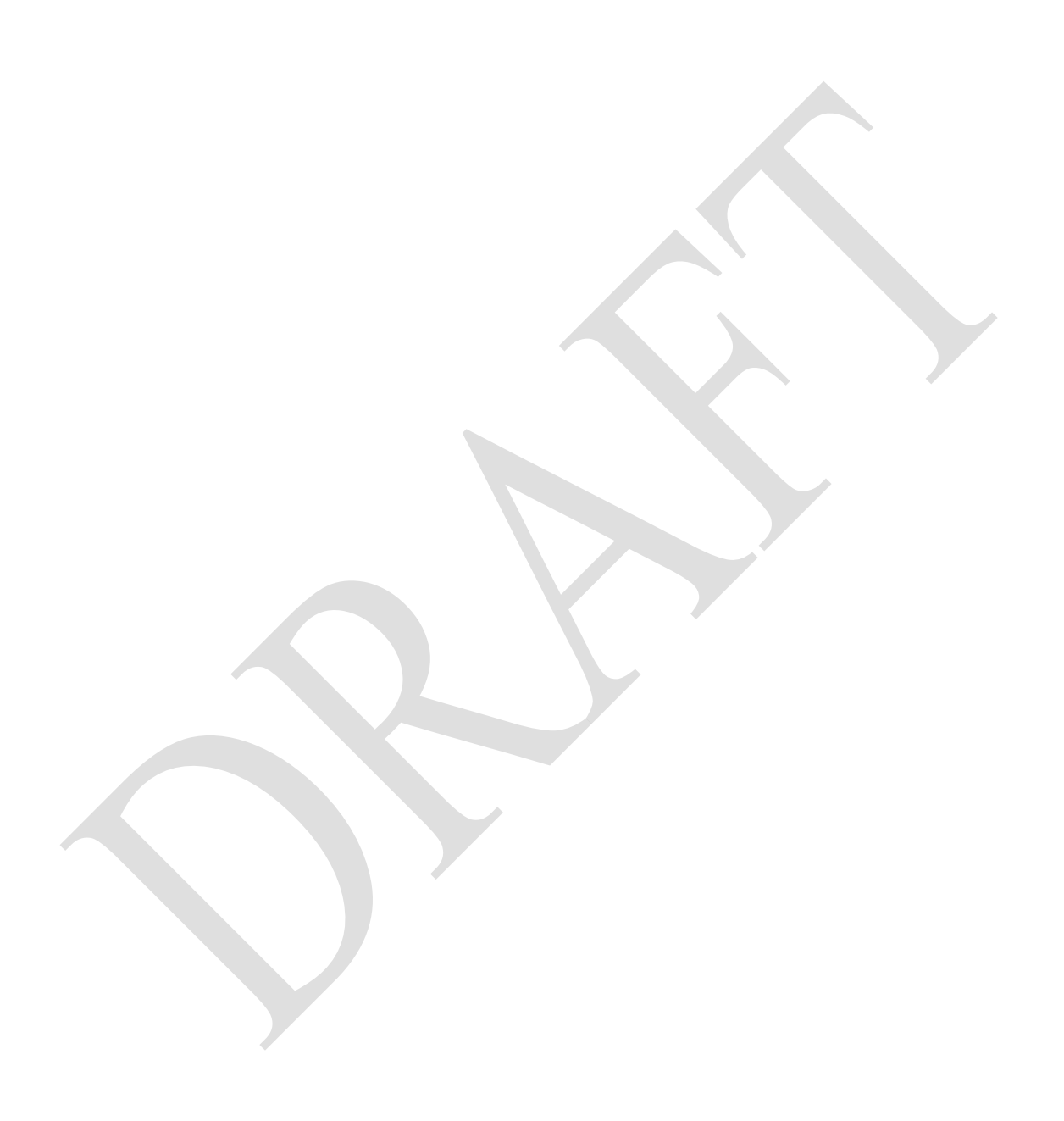
Annex 1 Appendix 1 - Information document on HDDF retrofit system intended to be fitted in road vehicles