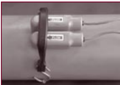
Figure 2 Secure the transducers in place