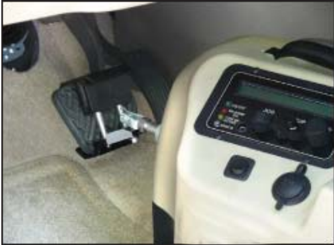
Fig. 1 Place claw on brake pedal

Note: The easiest way is to place the bottom of the claw under the pedal first, then slide the top of the claw over the top of the pedal.