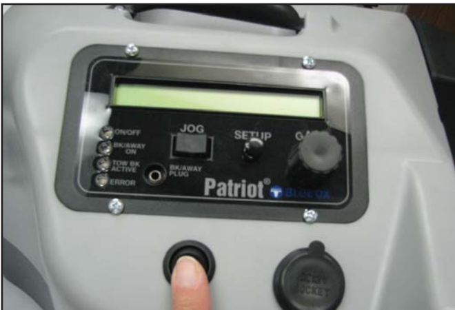
Fig. 2 Turn on Power Switch

Note: Seat must be as far forward as possible without