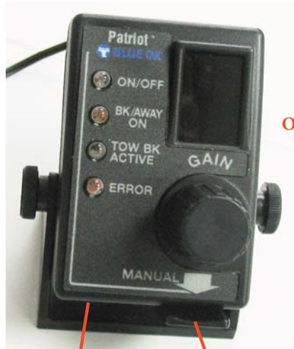
RF Remote Unit