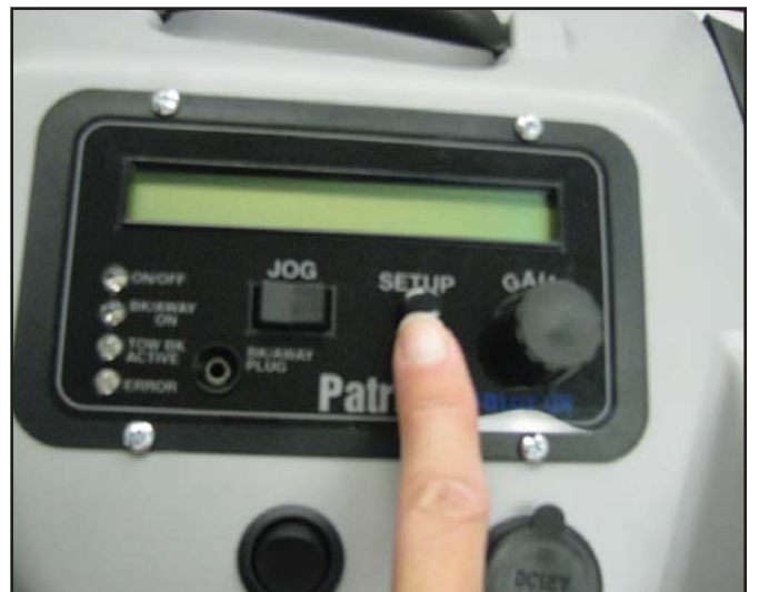
Fig. 4 Push the Setup Button

Note: If the brake extends fully and remains extended without stroking three times, the seat is not far enough forward. Turn the brake off then back on. Reposition the seat as far forward as possible without causing the brake lights to be activated then continue with Step 8.