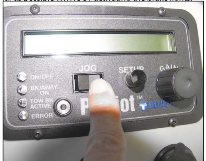
Fig. 3 Adjust the brake pedal with the Jog Switch