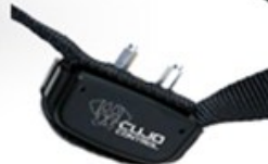
Collar & Receiver