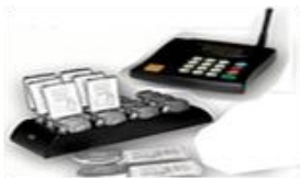
Nex Call Lite