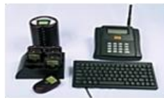
Nex Call Alpha