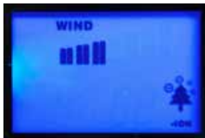
On Low without ozone

When the screen only shows the '-ion' (tree logo) this means all functions are on without Ozone (showing Low, Medium & High fan speed). Use this setting for occupied rooms when people or animals are present