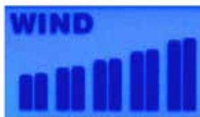
Fan Speed: Medium (20 m 2 room)