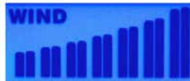
Fan Speed: High (30 m 2 room)