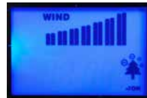
On High without ozone