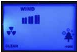
On Low with ozone

Maximum setting: All settings on with Ozone (Clean sign). Use this maximum setting for toilets & hallways etc. where people aren't present for long periods of time or use this maximum setting on high speed if you need a fast solution