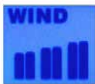
Fan Speed: Low (10 m 2 room)