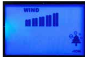
On Medium without ozone