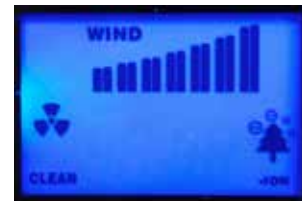
On High with ozone