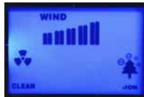
On Medium with ozone