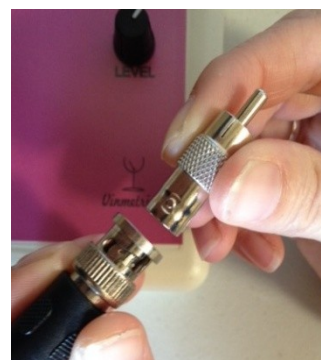
Figure 5. The adapter for the SC-50.