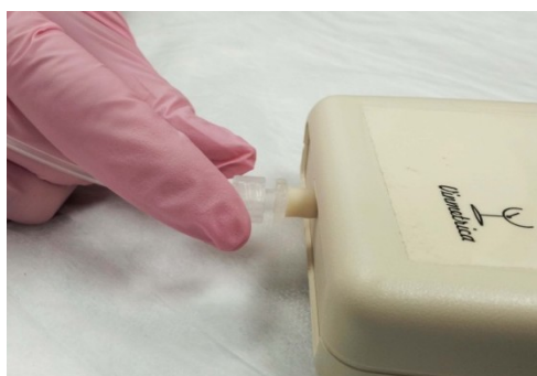
Figure 6. Unscrew the Luer Lock connector.