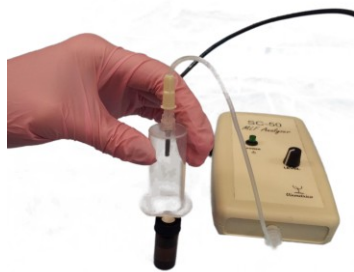
Figure 7. Position the opening of the vial insertion assembly over the vial.