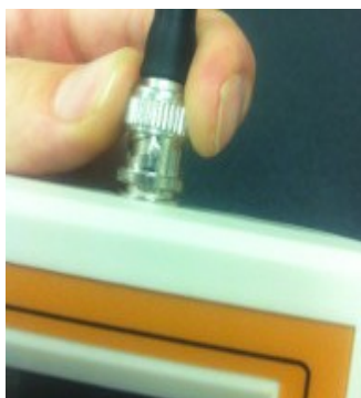
Figure 3. Be sure the cable plug is screwed into place on the BNC connector or firmly inserted into the RCA plug.