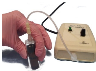
Figure 8. Gently but firmly push the assembly down onto the vial as far as it will go.