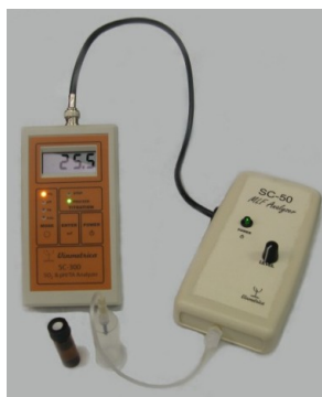
Figure 4. Recommended arrangement of the equipment