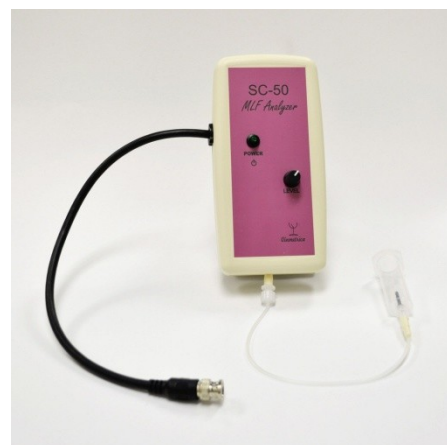
Figure 1. The SC-50 MLF Analyzer with vial insertion assembly