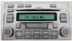
Factory Radio Not Included