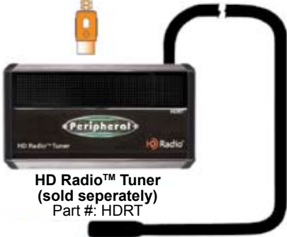
HD Radio™ Tuner (sold separately) Part #: HDRT