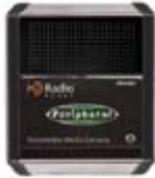
Media Gateway Part #: PXAMG