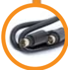
3Ft. HD Radio Cable (sold with HDRT)