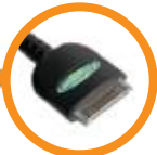
11Ft. iPod Cable