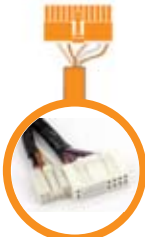
Media Gateway Harness Part #: PGHHY1