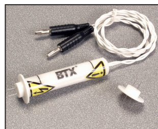
2 Needle Array™ Electrode

Internet: www.btxonline.com (click on customer service)