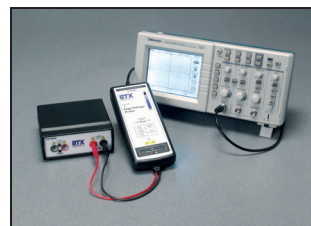
The Enhancer 3000 Monitoring System 45-0059 (110V)

(Shown with communications module not installed)