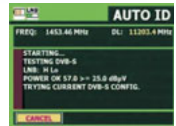
Automatic recognition of symbolrate and FEC |