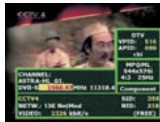
Signal display in DVB-S modes |