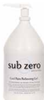
1 gallon LZ1050