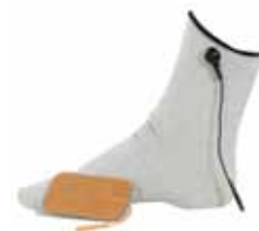
Conductive Sock GU4025