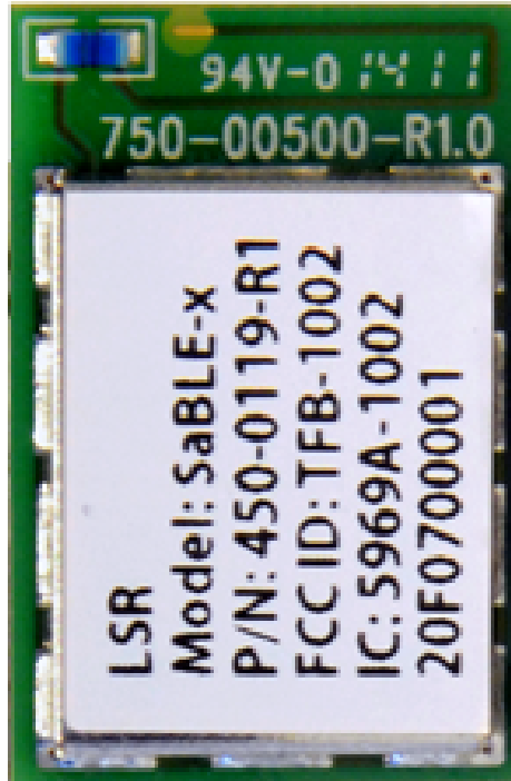
Figure 1 Top of SaBLE-x Module