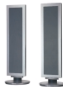
Optional Speakers with Desk Stands

RS-232C Control: 9 Pin D-Sub Connector (Male)