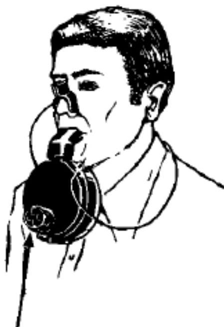
Figure 2 Using the Respirator