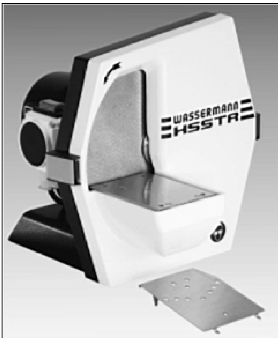
Fig. 1: HSS-TR