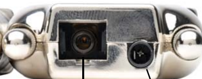
Optical Cable Input