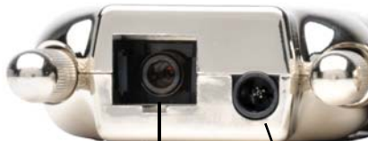
Optical Cable Input