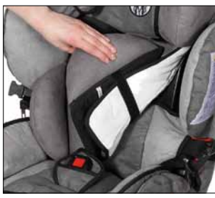
Fig. 3a: Positioning on the seat Fig. 3b: Velcro fastening

The lateral trunk support is attached to the seat. It can be removed, if not needed, by opening the Velcro behind the back cover. The cover is machine washable up to 30^{\circ} C / 86^{\circ} F.