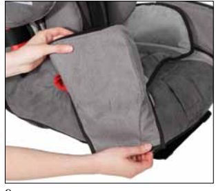
Fig. 9a: Attaching side parts Fig. 9b: Applying table

The cover can be removed and is machine washable up to 30°C / 86°F.