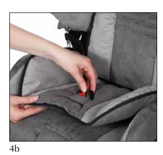
Fig. 4a: Removing 5-point harness pad from belt buckle Fig. 4b: Positioning on the seat / guiding belt buckle through slot

The cover can be removed and washed in the machine at up to 30° C / 86° F.