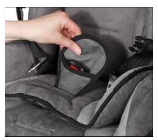
Fig. 8b: Attaching big 5-point harness pad

Fig. 8a: Removing small standard 5-point harness pad