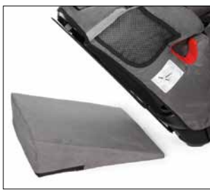
Fig. 6b: Adjusting height to vehicle