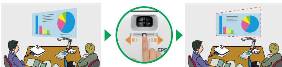
Horizontal Keystone Correction Adjuster: This intuitive new slider lets you adjust images to the correct shape when the projector is at an angle to the screen

Eliminate the need for photocopies: share 3D objects using the ELPDC06 visualiser