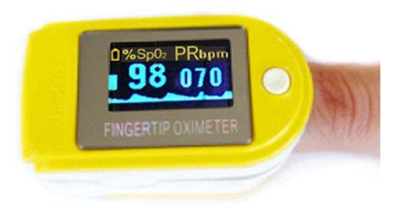
Figure 5. Put finger in position