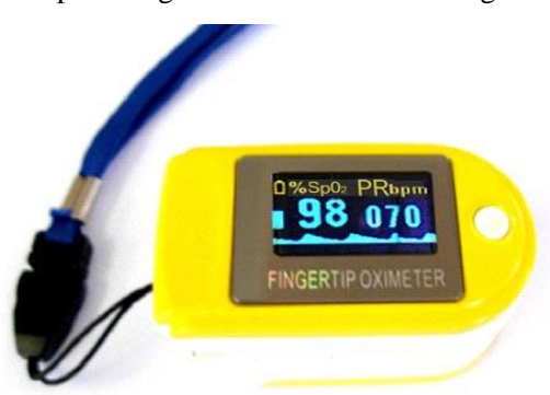
Figure 4. Mounting the hanging rope

Step 2. Put another end of the rope through the first one and then tighten it.