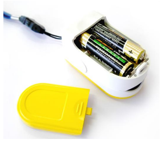
Figure 3.Batteries Installation

⚠Please take care when you insert the batteries for the improper insertion may damage the device.