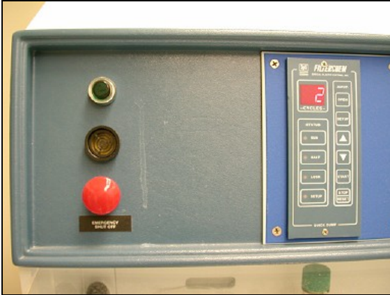
Emergency Stop and QDR Control