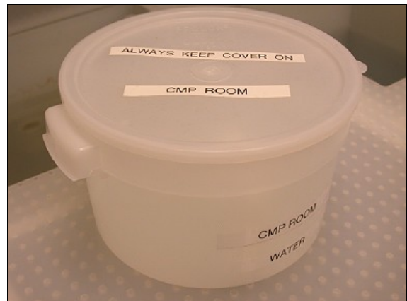
PVA Sponge in Water Container