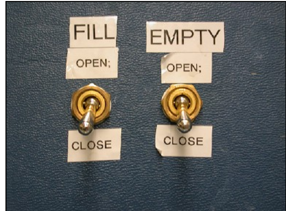
Megasonic Bath Fill and Drain