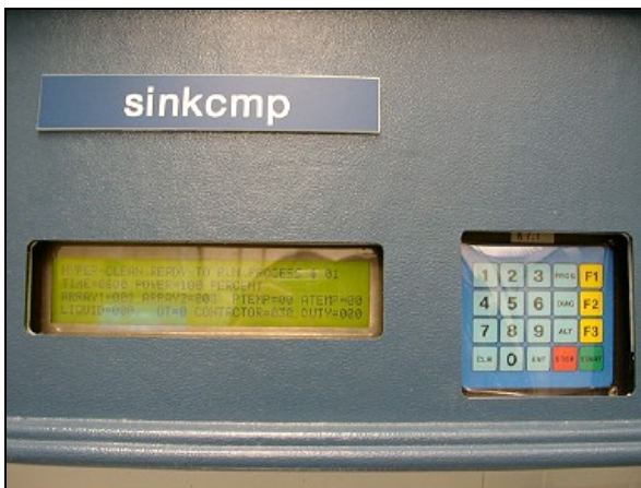
Megasonic Bath Control