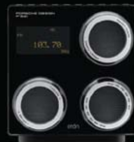
Table Top Stereo System with Clock for iPod/iFM Ready/AM/FM/Shortwave/RDS (Radio Data System) Some say it's enough for a radio to sound good - we think, it takes more than that. The Porsche Design P'9120 by Etón captures the essence of what made Porsche Design legendary: a clean, sleek shape. A design that is engineered. A form that reflects function. As the stereo performance stays true to the Etón name - presenting a new generation of radios.