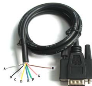
9 pin cable