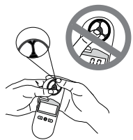
Replacing the Impeller

You may recalibrate the wind speed readings by replacing the impeller. Press FIRMLY on the sides of the black impeller housing with your thumbs to remove the entire assembly. When inserting the new impeller, be sure the arrow is facing the display side of the unit, and is aligned with the top of the meter. Press on the sides of the housing rather than the center.