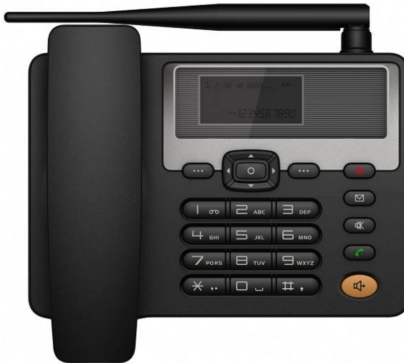
Figure 1 FWPCD1-02 Appearance