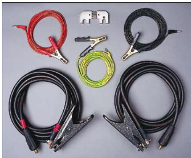
Cable set and current shunt