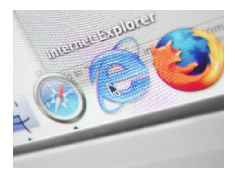
Figure 4: Different Internet browsers.