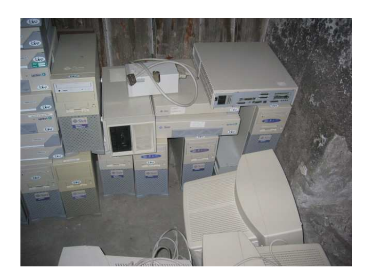
Figure 2: While others are retired...