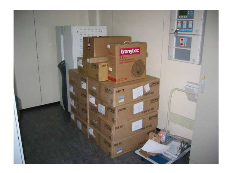
Figure 1: Computer are bought.

In every company there is a need to manage the hardware. With only a few we don't need special tools but the more we have, more complex is the task. The machines change, computer are bought, while others break down or are retired. You need some informations like an identifier, some network data, the components installed on this computer, the main user, the place, the purchase date, the warranty informations, the serial number, the software installed on to keep a trace of that without having too much troubles. The goal of this application is to develop a system with a web interface on all those informations in order to retrieve all the needed info as fast as possible.