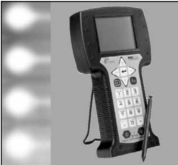
FIGURE 2. A fold-away stand provides the correct viewing angle on the bench, and flips up to a locked position for secure hanging in the plant.

The result is the universal, user upgradeable, intrinsically safe, rugged and reliable 375 Field Communicator.