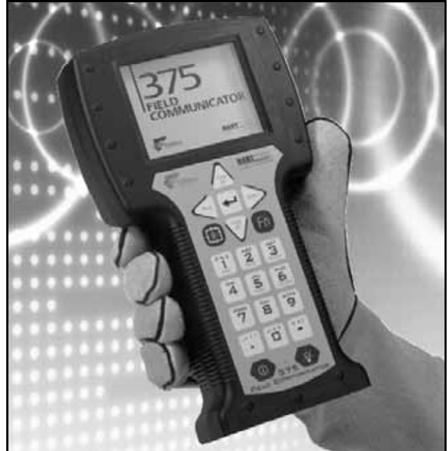
FIGURE 1. The 375 Field Communicator is designed to support all HART and all FOUNDATION fieldbus devices from all vendors.