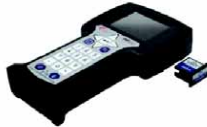
FIGURE 5. The Configuration Expansion Module safely stores hundreds of device configurations.

Transfer device configuration data to AMS Device Manager via the IrDA port on the 375 Field Communicator and your PC. Carry your 375 Field Communicator out to the field to configure or update one or many devices. Save device configurations in your 375 Field Communicator or transfer to AMS Device Manager. The optional Configuration Expansion Module easily stores 500 or more device configurations safely in your 375 Field Communicator.