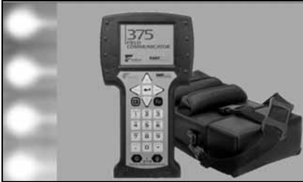
FIGURE 3. The 375 Field Communicator provides a single tool for configuring and diagnosing HART and FOUNDATION fieldbus devices.