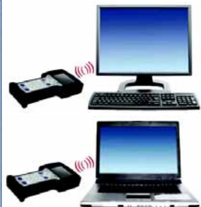
FIGURE 4. Easy Upgrade allows communication between the 375 Field Communicator and a PC using IrDA. The IrDA port enables transfer of configuration data and upgrades between the 375 and AMS Device Manager.