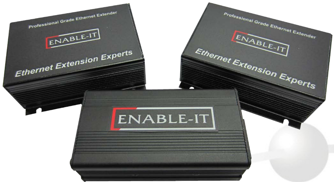
Figure 1 Enable-IT 375 included with the 865PTZQ PoE & Ethernet Extender Kit