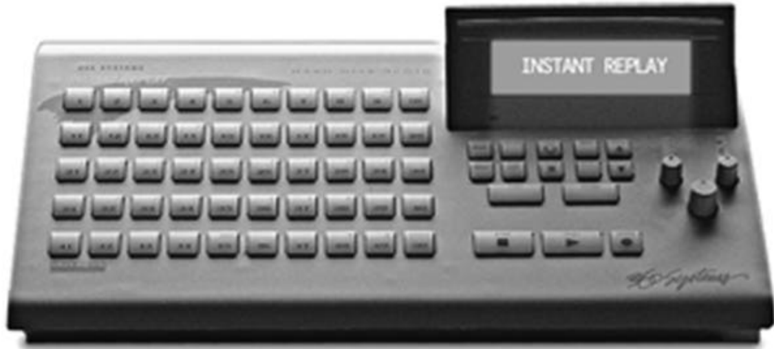
FRONT PANEL LAYOUT