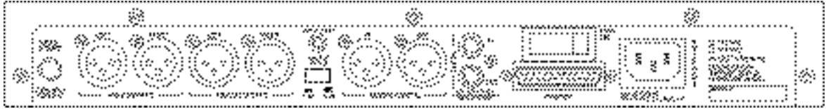
INSTANT REPLAY REAR PANEL