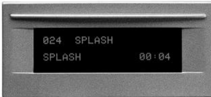
THE DISPLAY MODULE

For most operations, the display shows the Index number, Cut title, and the running time of the currently selected Cut.