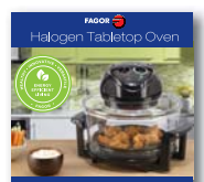
Halogen Tabletop Oven DVD