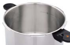
MAX Line Indicator tells you when you have reached maximum filling capacity.