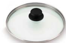
A Tempered Glass Lid that turns your pressure cooker into a stock pot.