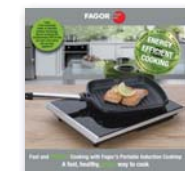
Portable Induction Cooktop DVD