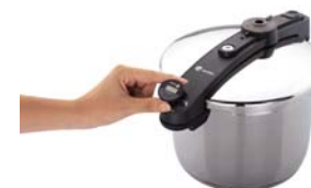
Removable Timer to travel with you while you are cooking.