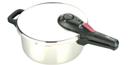
Splendid 4 qt.