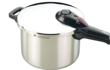
Splendid 6 qt.