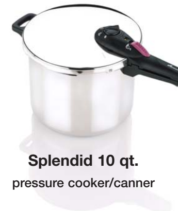
Splendid 10 qt. pressure cooker/canner