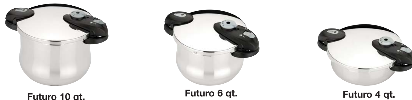
Futuro 10 qt. pressure cooker/canner

Fagor's Futuro pressure cooker model comes complete with compact handles for easy storage, an automatic locking lid for added convenience, an easy-cleaning valve, a steamer basket that doubles as a food grater, and a "Tastefully Under Pressure" cookbook with over 90 delicious recipes.