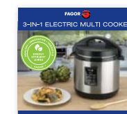
3-in-1 Electric Multi-Cooker DVD