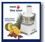
Slow Juicer DVD