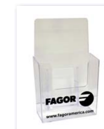
Acrylic Brochure Holder with Fagor Logo