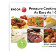
Pressure Cooking is As Easy as 1-2-3 DVD