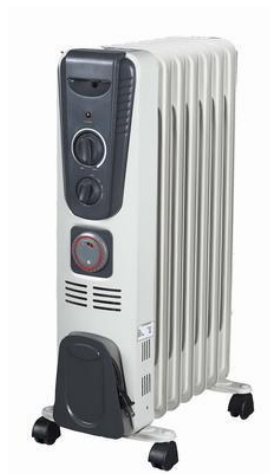
FIGURE 2: TYPICAL OIL-FILLED HEATER