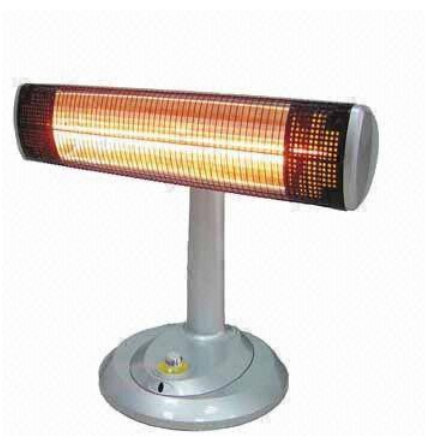
FIGURE 4: PORTABLE INFRARED HEATER

Infrared heaters, as seen in Figure 4, use a built-in infrared lamp to emit invisible infrared light at an adjustable intensity. This light increases the temperature of the object it makes contact with, without heating the air.