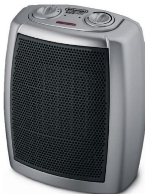
FIGURE 3: A TYPICAL PORTABLE CERAMIC HEATER

The working principle of the ceramic heater is similar to the fan-forced heater.