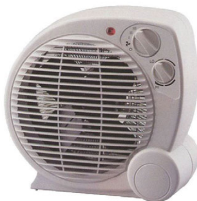
FIGURE 1: TYPICAL FAN FORCED HEATER

Fan-forced heaters are heated by passing electric current through the coil elements, thus heating the coils inside the heater. A built-in ventilator blows the air through the heated coils while heating the air in the process.