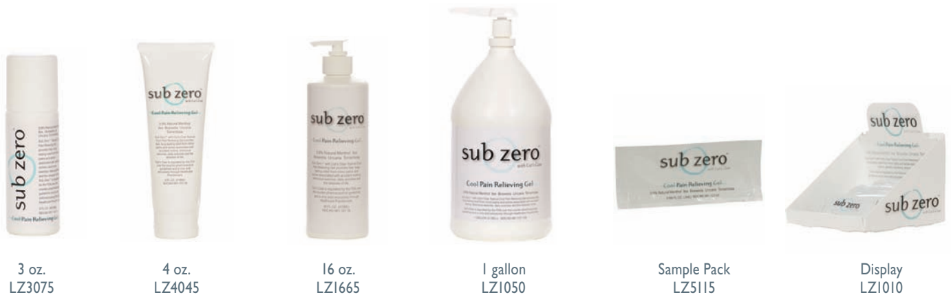
3 oz. LZ3075