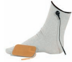
Conductive Sock GU4025