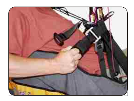
Adjusting of lateral straps

When correctly adjusted you feel only light pressure on both back and shoulder. If the lateral straps are too loose you will feel pressure on your shoulders from the shoulder straps. By pulling on them you change the position. If you feel pressure on your back, release the lateral straps by pulling the loop on the flat buckles within the tunnel of Neoprene material.