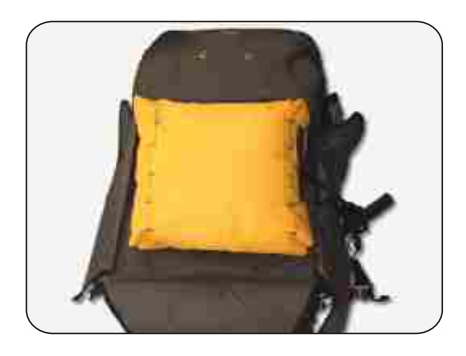
Attention! Other placements leads to malfunction of the system!

1. Place the Goya inner container with rescue canopy onto the outer container as shown in the picture below. The rescue canopy bridle leads to the tunnel on the right-hand side. The line loop of the rescue canopy is placed between the seat plate and reserve and the handle leads to its correct place on the harness.