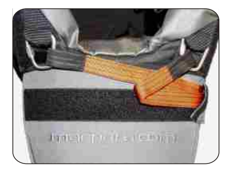
connection 1, 2