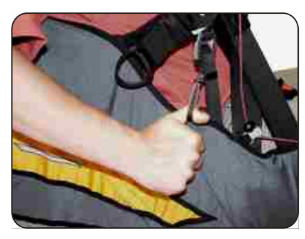
Adjusting of bottom lateral straps