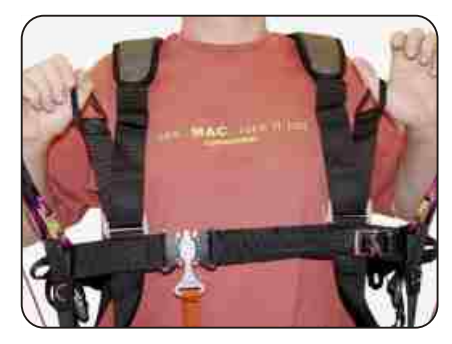
Adjusting of shoulder straps