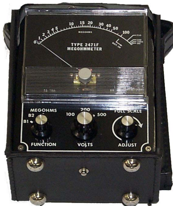
Figure 4: General View of the Megohmmeter 2471F