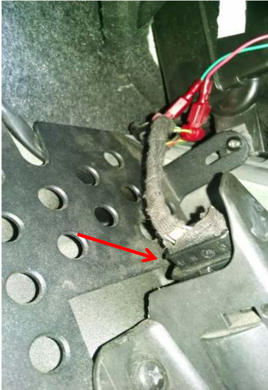
Figure 5 (Accelerator Pedal Position Sensor)