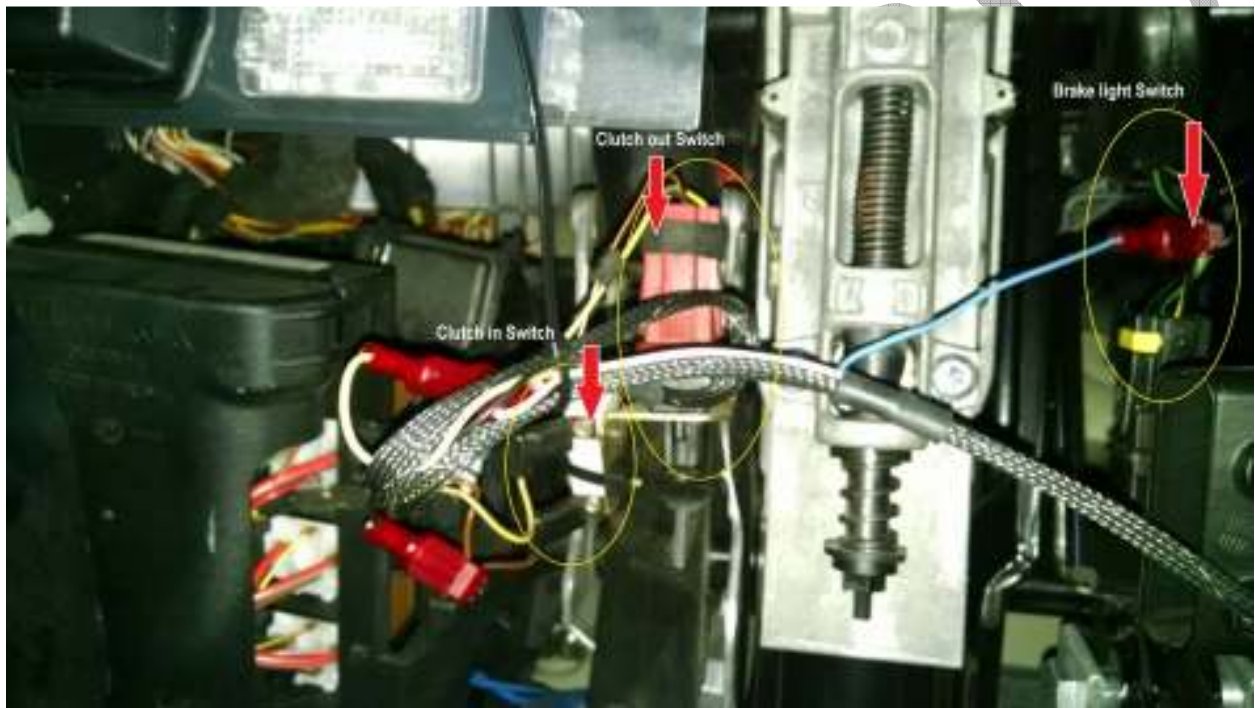
Figure 1 (General overview of the Sensors)

In order for your AUTO-BLiP unit to function properly, you must first perform the calibration sequence outlined in the CALIBRATING UNIT section!!!