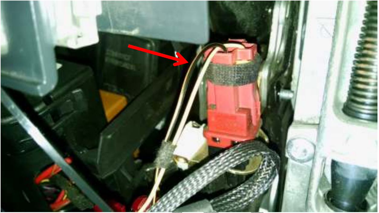
Figure 3 (Clutch OUT Sensor 12v power supply)