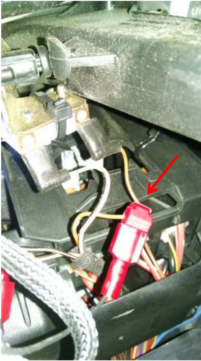
Figure 2 (Clutch IN Sensors Ground connection)

Note: In this picture the Clutch IN Switch is zip tied shut for racing applications. This is not required as part of the installation.