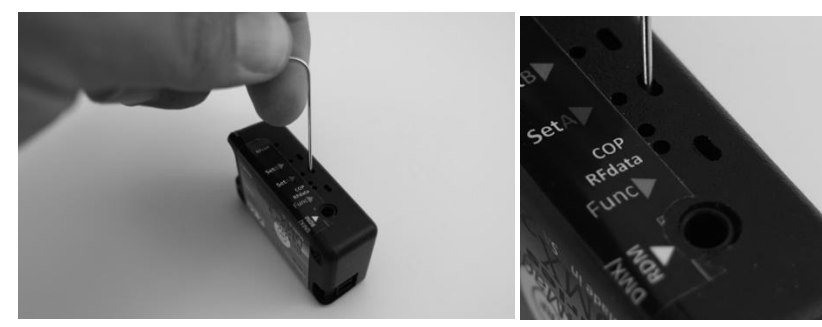
Pressing SetA on an RC4 Series 3 DMX2dim. The DimA indicator is behind the round hole. The button is behind the slotted hole. With a DMX channel set higher than 20%, press the SetA button and the DimA indicator will come on. Dimmer A is now assigned to that channel. It remembers this setting until you change it by pressing the button again.