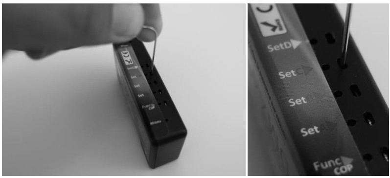
Pressing SetC on an RC4 Series 3 DMX4dim. The DimC indicator is behind the round hole. The button is behind the slotted hole. With a DMX channel set higher than 20%, press the SetC button and the DimC indicator will come on. Dimmer C is now assigned to that channel.