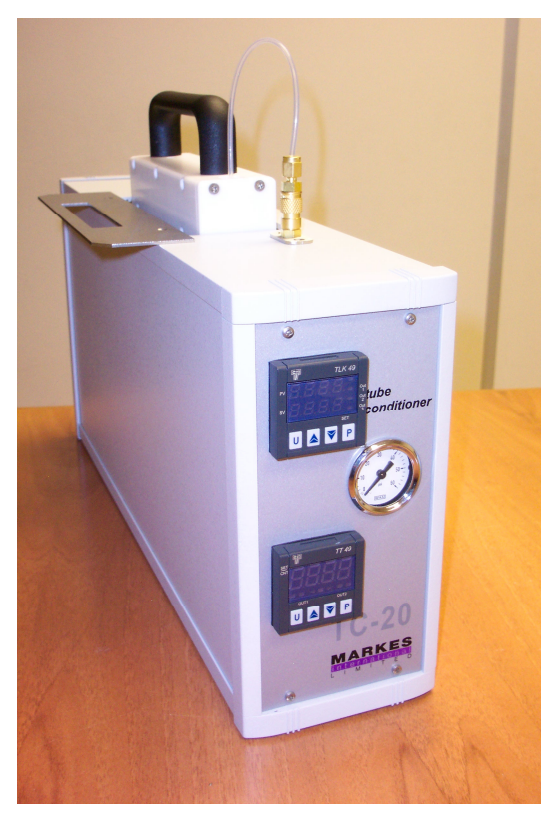
Figure 1: Front view of TC-20.

It is strongly recommended that a large-capacity hydrocarbon filter is installed in the carrier gas line as close to the TC-20 as possible, to remove any trace level hydrocarbons from the carrier gas.