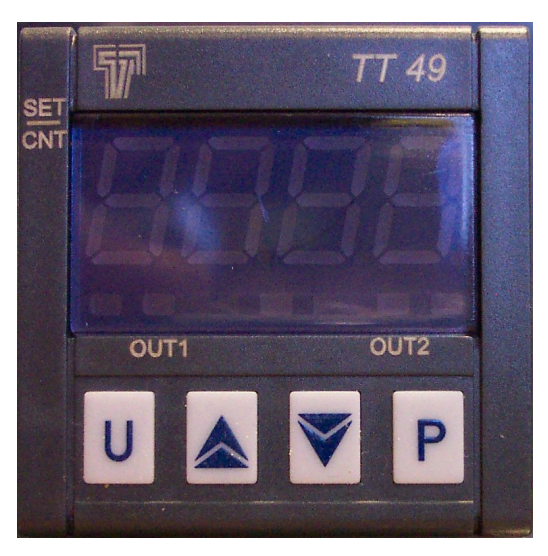
Figure 5: Timer controller.

The TC-20 run time can be set from 1 minute to 99 hours 59 minutes using the timer controller (Figure 5).