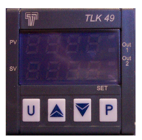
Figure 4: Temperature controller.

The TC-20 can operate between 50°C to 400°C using the temperature controller (Figure 4).