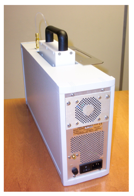
Figure 2: Rear view of TC-20.