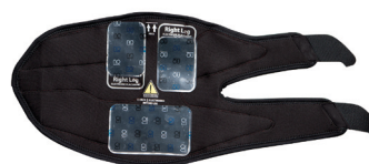
Fig. 1 Left

STOP! If you are using the garment for your LEFT leg, you should have it set up to look like Fig. 1