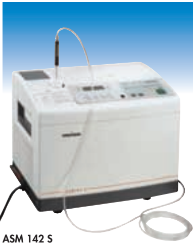
ASM 142 S