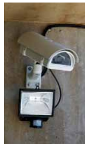
Exterior Security Lighting