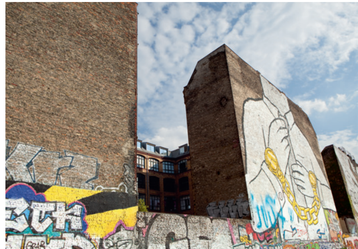
Top: Spring 2010: Commissioned by the building’s new owner, four internationally recognized street artists reinterpreted the “Bierpinsel” in Steglitz, Berlin. Bottom: For street artists, Berlin’s abundance of raw and dynamic spaces makes it a city of infinite opportunities. The German capital has become a breeding ground for many artists who today enjoy international recognition.