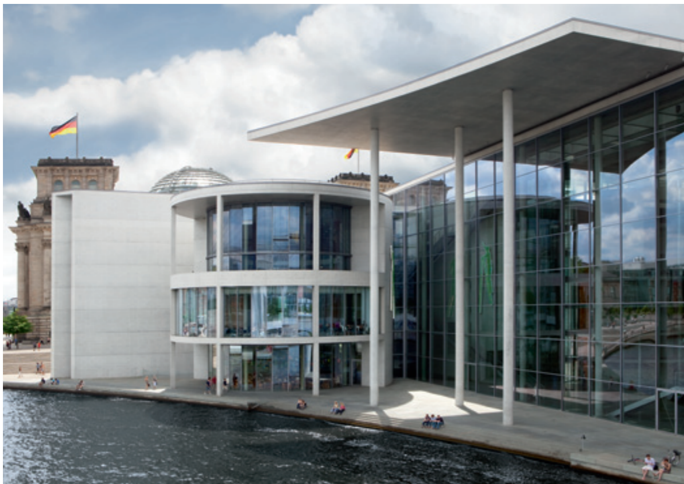
Only in Berlin can you find deck chairs and a beach atmosphere in the heart of the government quarter.

Berlin is unique in many ways, and with the fall of the wall it became the site of a great architectural experiment, unmatched in any contemporary European city. Foremost among these extraordinary projects are Potsdamer Platz and the new government district, extending to the north of the Reichstag. The master plan by Berlin architects Schultes Frank Architekten is acknowledged as a work of genius. And even that has tradition in Berlin: the New National Gallery, located not far from the government district, was created by one-time Bauhaus director Mies van der Rohe from 1965 to 1968 and is today considered an icon of classic modernism.