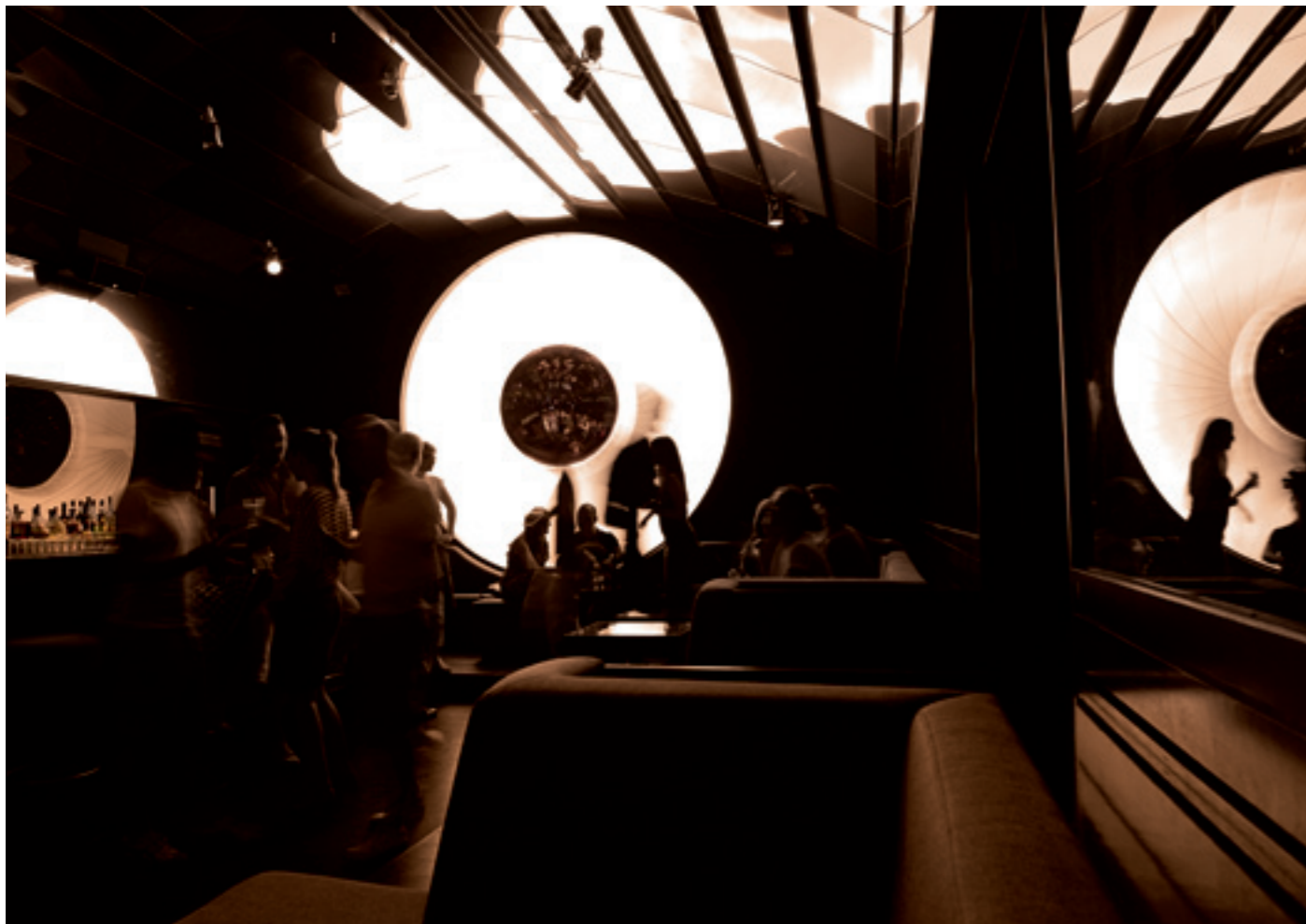
Berlin, New York, London, Tokyo! With its funky interior in 1980s nightclub style, Bar Tausend is the epitome of the international party lifestyle. The light installation at the far side of the room, "Das Auge" (The Eye), is by the Berlin lighting designer Schneider-Moll, and was once featured in the Louis Vuitton showroom in Paris.

Ⓜ A trademark of the Leica Camera Group "Leica" and product names = ® registered trademarks © 2010 Leica Camera AG HDMI, the HDMI logo, and High-Definition Multimedia Interface are trademarks or registered trademarks of HDMI Licensing LLC. We reserve the right to make changes in construction, features, and offers without advance notice. Concept and design: argonauten G2, Frankfurt Product photography: Alexander Göhr Editorial photography: Maik Scharfscheer Brochure order no.: German 91 538 / English 91 539 / French 91 540 / Japanese 91 541 / Chinese (simplified) 91 548, (09/2010) Leica Camera AG / Oskar-Barnack-Strasse 11 / 35606 SOLMS / GERMANY Phone +49(0)6442-208-0 / Fax +49(0)6442-208-333 / www.leica-camera.com