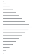
Table 2: ThinPrep Imaging System Mounting Media/Clearing Agent Validation Summaries