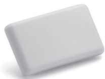
F145-1328 Indoor Remote Sensor