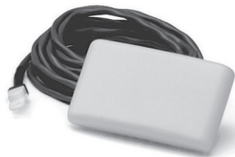
F145-1378 Outdoor Remote Sensor