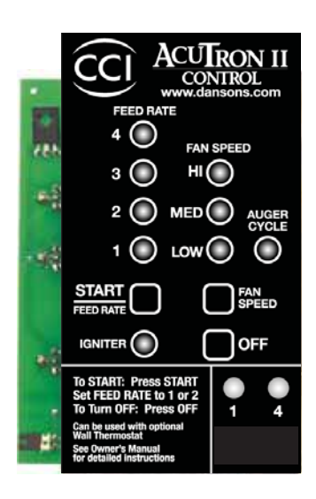
AcuTron Control Board