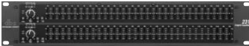
231- Dual Channel 31 Band Graphic EQ

Input Gain Control: This control sets the signal level to the equalizer. It is capable of -12dB to +12dB of gain. Its effect is apparent by viewing the OUTPUT LEVEL BAR GRAPH.