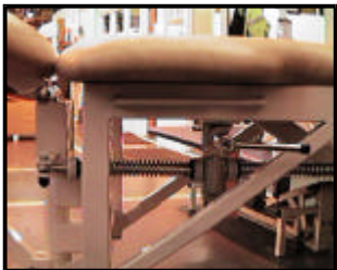
Side Bending Release Lever

To release the foot section to enable side bending :-